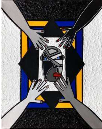
Shatterbox , 2022