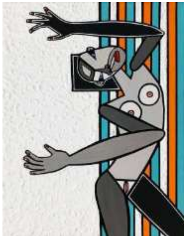
Sideways, 2022 acrylic, ink pen and pumice on canvas1 x 14 inches / 27.94 x 35.56 cm