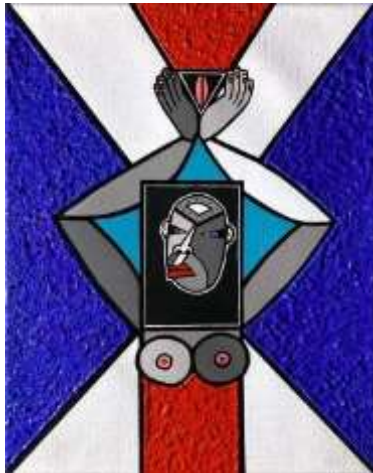
What If, , 2022

acrylic, ink pen and pumice on canvas11 x 14 inches / 27.94 x 35.56 cm