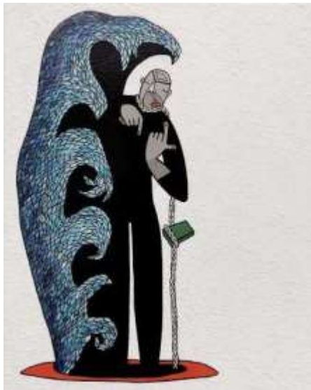
Money vs. Life, 2021

acrylic, ink pen, pumice and hand cut paper collage on canvas30 x 24 inches / 76.2 x 60.96 cm