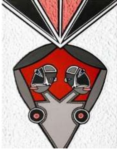
Venus , 2022 acrylic, ink pen and pumice on canvas1 x 14 inches / 27.94 x 35.56 cm