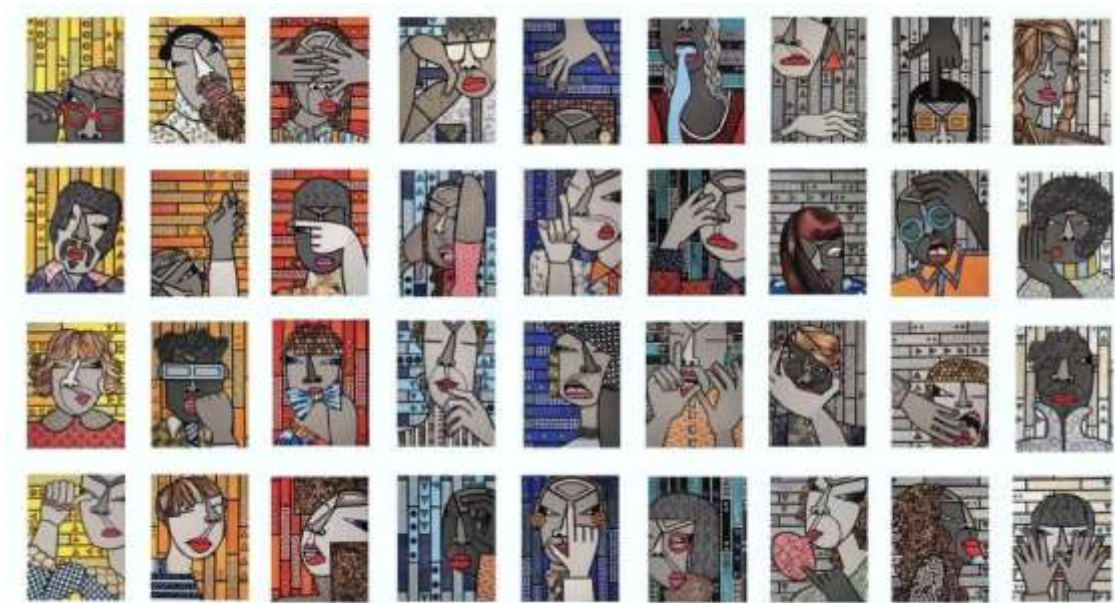
Diffusion of Responsibility, 2021

acrylic, ink pen and hand cut paper collage on canvas