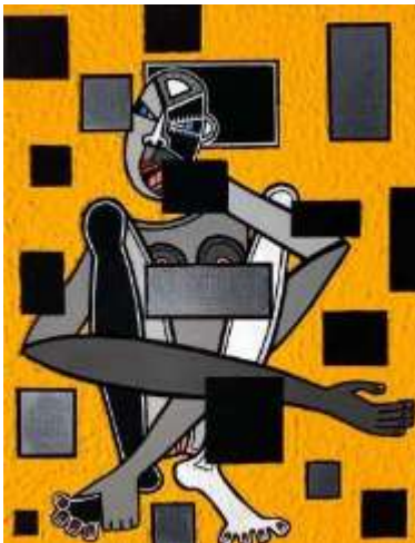
Broken One , 2022

acrylic, ink pen and pumice on canvas 11 x 14 inches / 27.94 x 35.56 cm