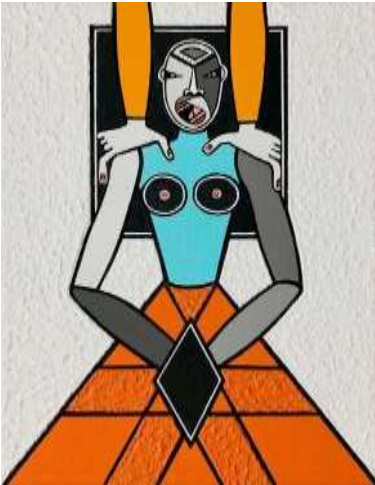
Rocket Launch , 2022

acrylic, ink pen and pumice on canvas 11 x 14 inches / 27.94 x 35.56 cm