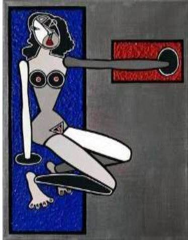
4 Holes , 2022

acrylic, ink pen and pumice on canvas11 x 14 inches / 27.94 x 35.56 cm