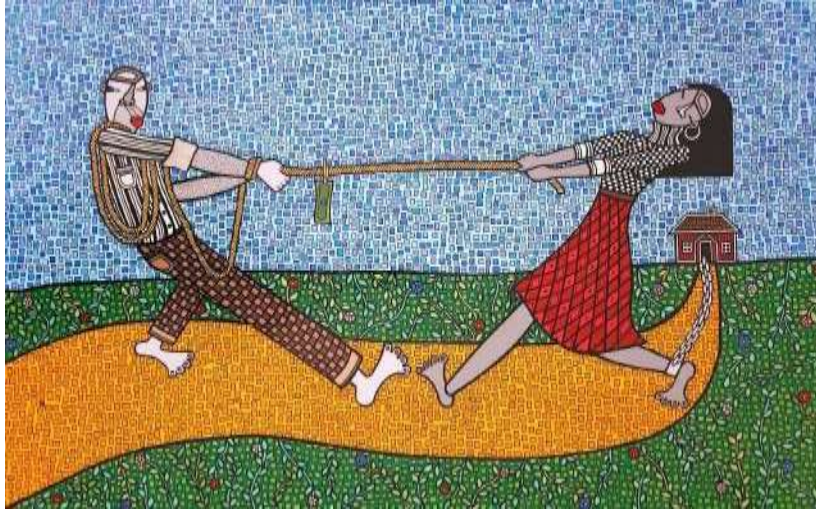
Pay Gap Trap, 2023

acrylic, ink pen hand cut paper collage on canvas25