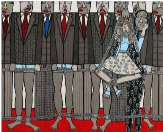
Supreme Scheme, 2018-2021

acrylic, ink pen, pumice and hand cut paper collage on canvas30 x 24 inches / 76.2 x 60.96 cm