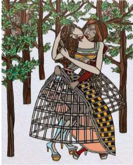
Let the Right One In, 2021

acrylic, ink pen, pumice and hand cut paper collage on canvas30 x 24 inches / 76.2 x 60.96 cm