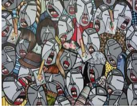
Face-it! (part 8), 2019