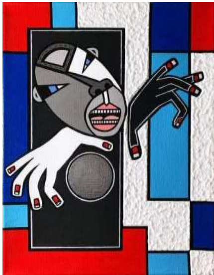
Puppeteer , 2022

acrylic, ink pen and pumice on canvas11 x 14 inches / 27.94 x 35.56 cm