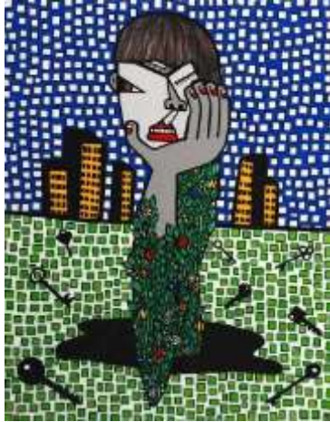
Keys to the Kingdom, 2023 acrylic, ink pen and hand cut paper collage on canvas 11 x 14 inches / 27.94 x 35.56 cm