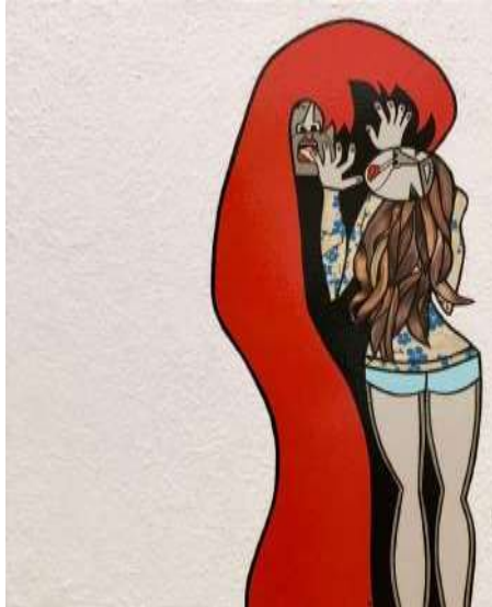
Men then Women, 2021

acrylic, ink pen, pumice and hand cut paper collage on canvas30 x 24 inches / 76.2 x 60.96 cm