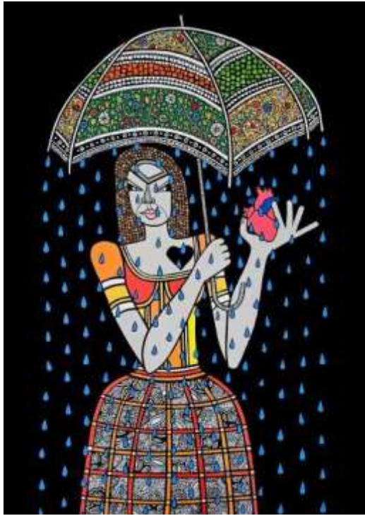
Happy on the Outside, 2023

acrylic, ink pen and hand cut paper collage on canvas 28