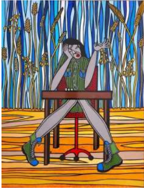
Destined by Destiny, 2023

acrylic, ink pen and hand cut paper collage on canvas26 x 20 inches / 66.04 x 50.8 cm