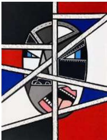
Van Halen , 2022