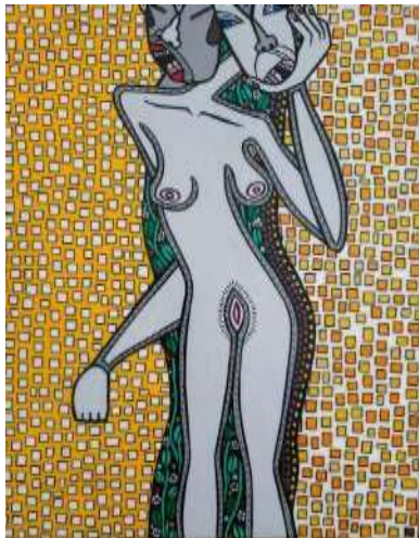
Men on my shoulder, 2023 acrylic, ink pen and hand cut paper collage on canvas 11 x 14 inches / 27.94 x 35.56 cm