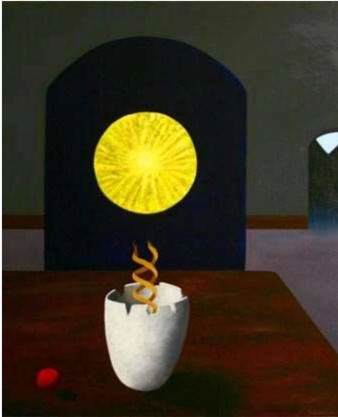
The Transformer, olie, 70 x 60 cm, 2022