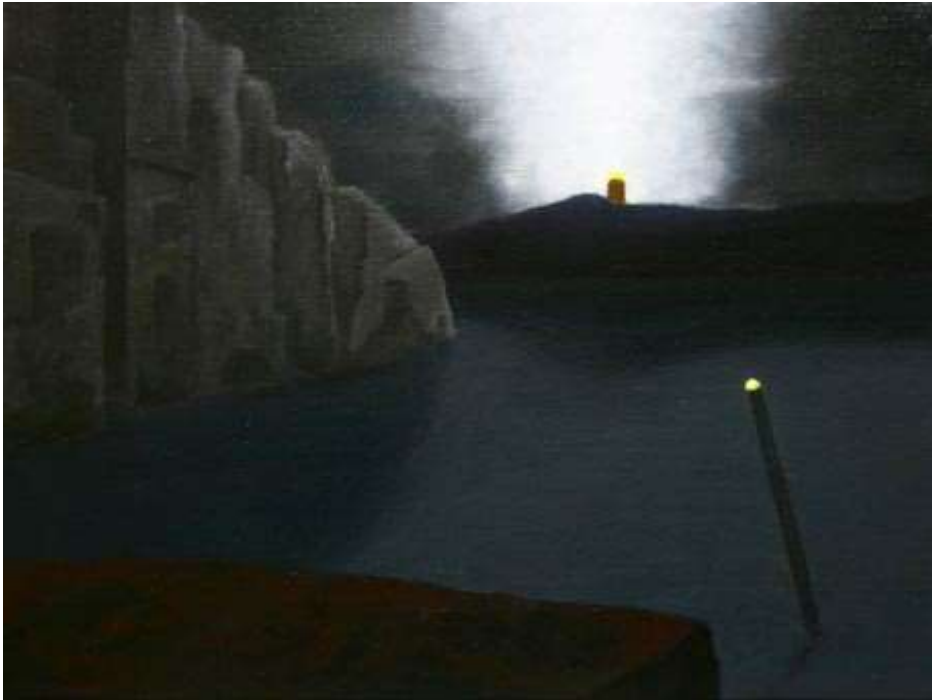
The Distant Tower, olie, 30 x 40 cm, 2023