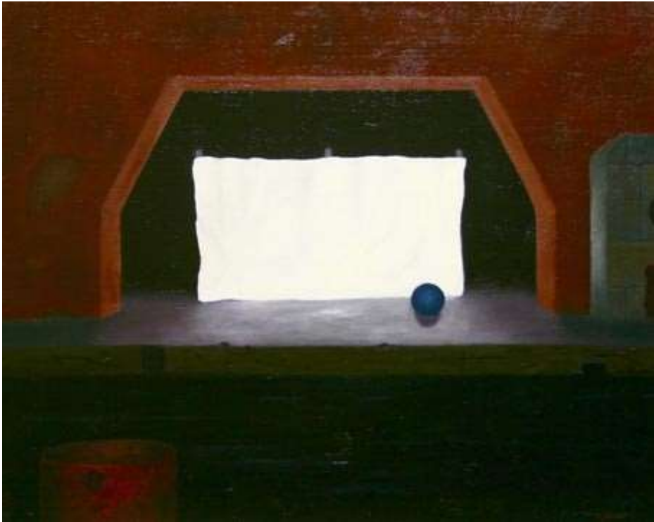
Internal Light, olie, 40 x 50 cm, 2023