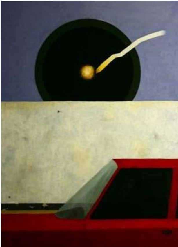
Time Shaft, olie, 110 x 80 cm, 2023