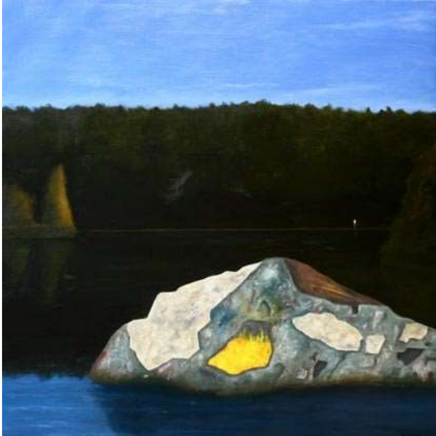
Burning Stone-Matter Transformed, olie, 65 x 65 cm, 2023