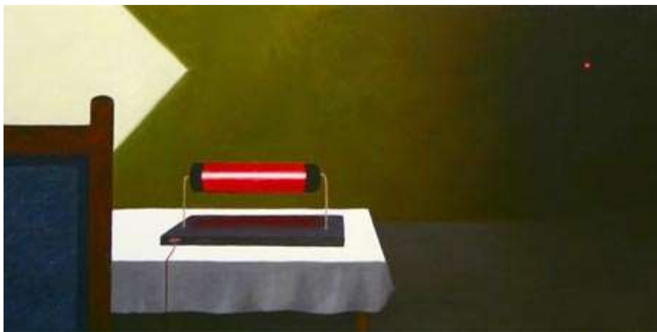
Metaphysical Signal, olie, 40 x 80 cm, 2023