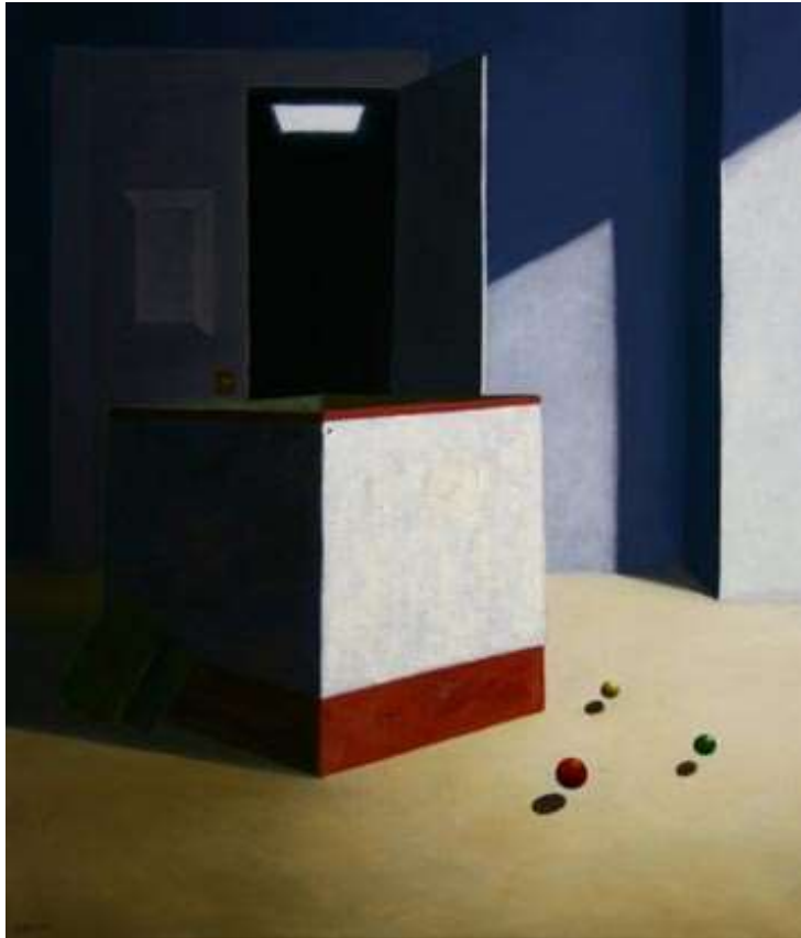
Abandoned Rooms, olie,70 x 60 cm, 2023