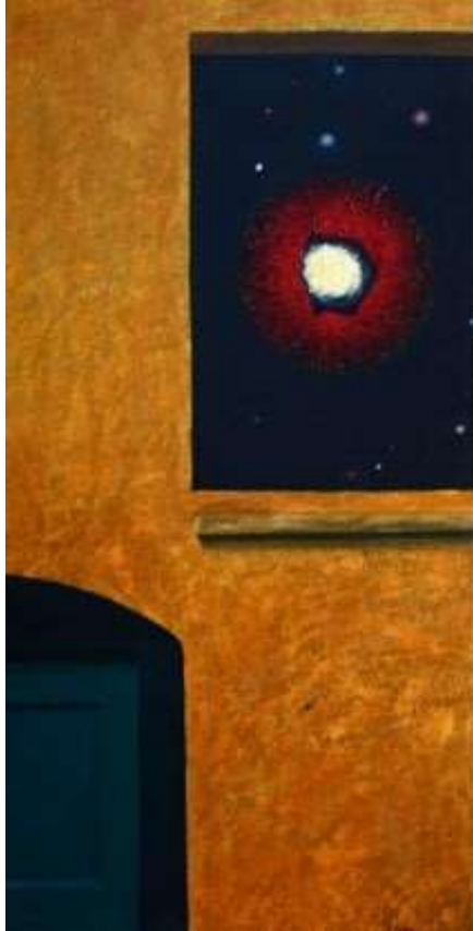
The Red Opener, olie, 80 x 40 cm, 2023