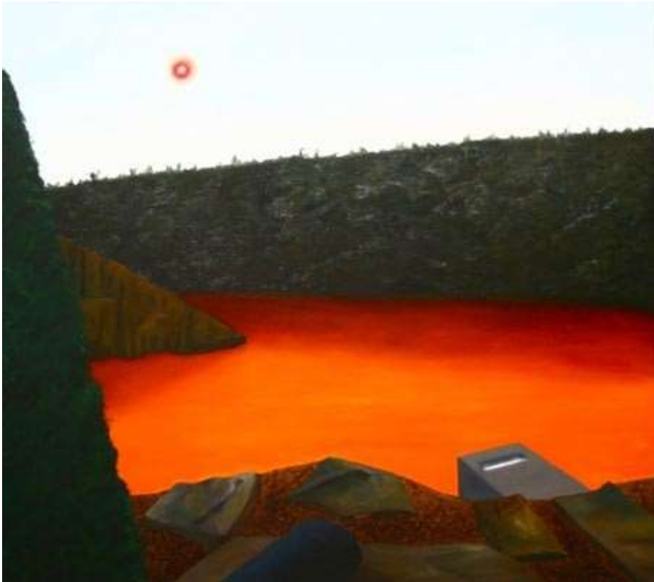
The Transformed Lake, olie, 81 x 90 cm, 2023