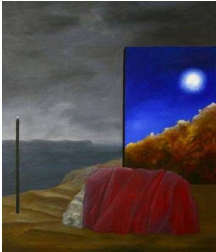
The Screen, olie, 70 x 60 cm, 2022