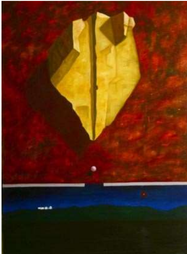
Time Barrier (homage á Erik Olson) olie, 110 x 80 cm, 2023