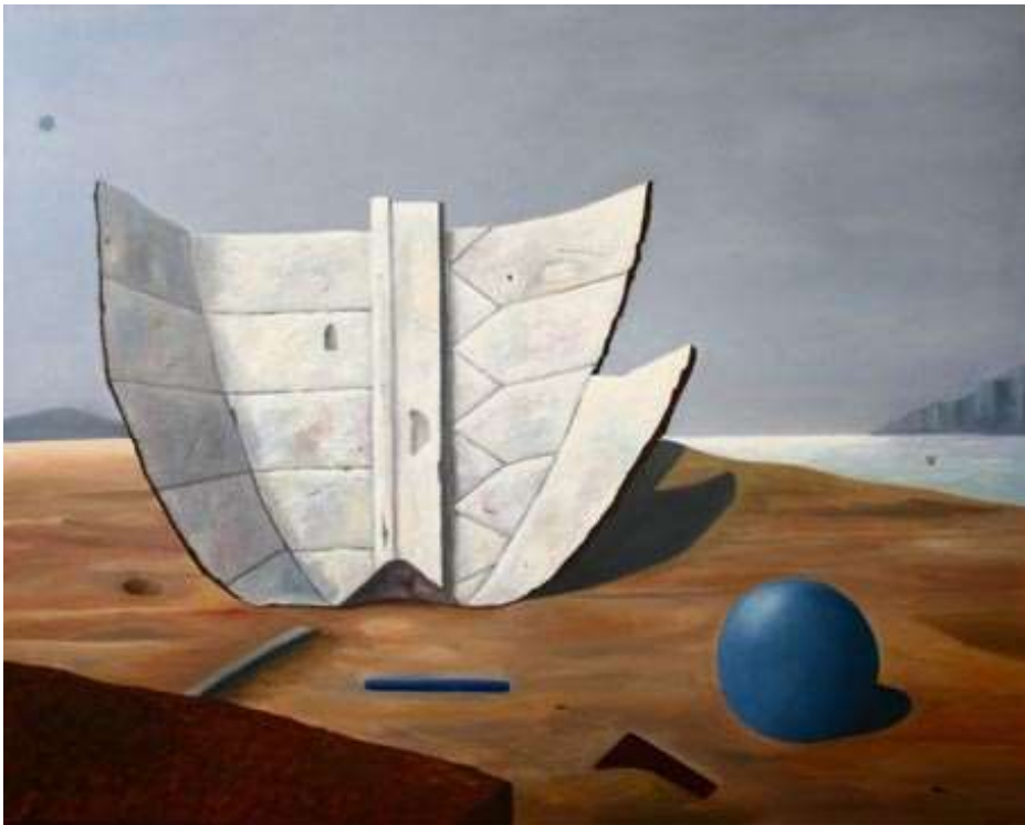
Meditation Beach, olie, 113 x 90 cm, 2023