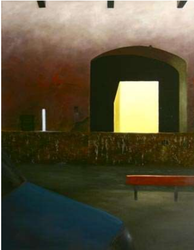
Harbour Light, olie, 80 x 60 cm, 2020