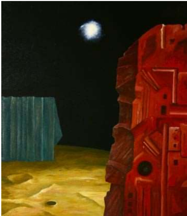
Hidden Screen,olie, 70 x 60 cm, 2022