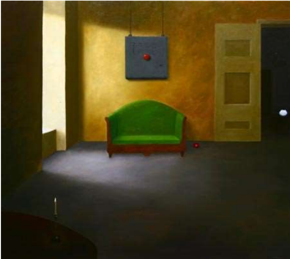
Time and Room, olie, 80 x 80 cm, 2022