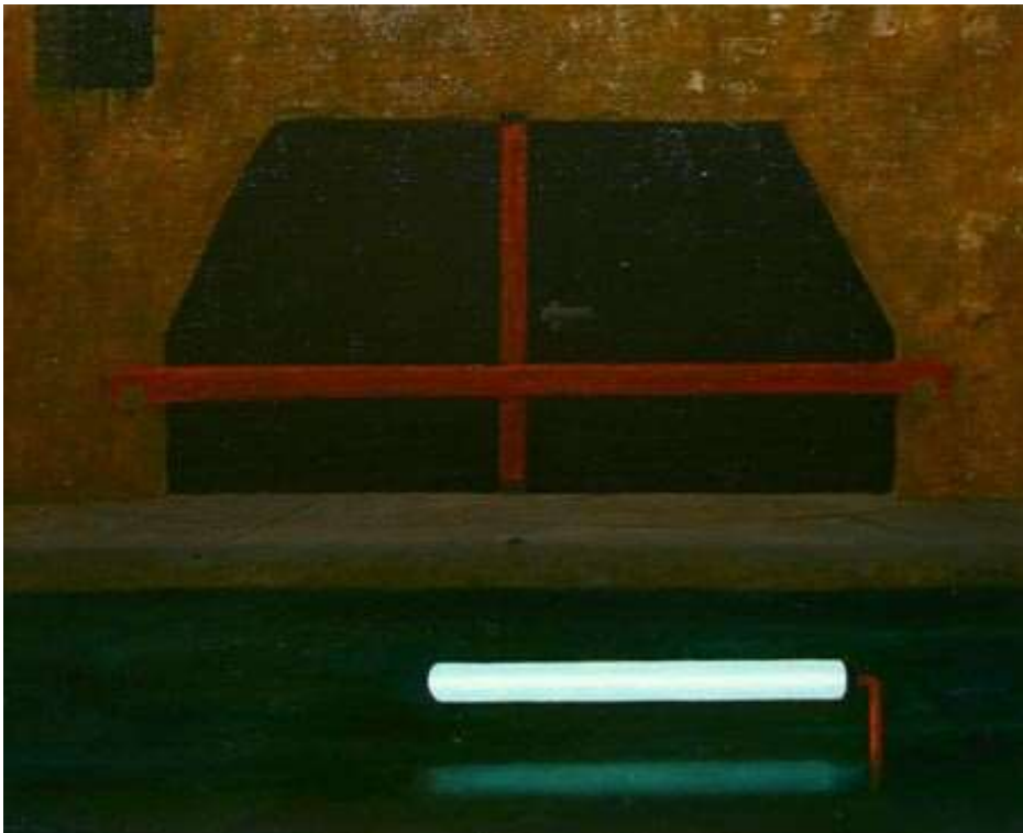
External Light, olie, 40 x 50 cm, 2023