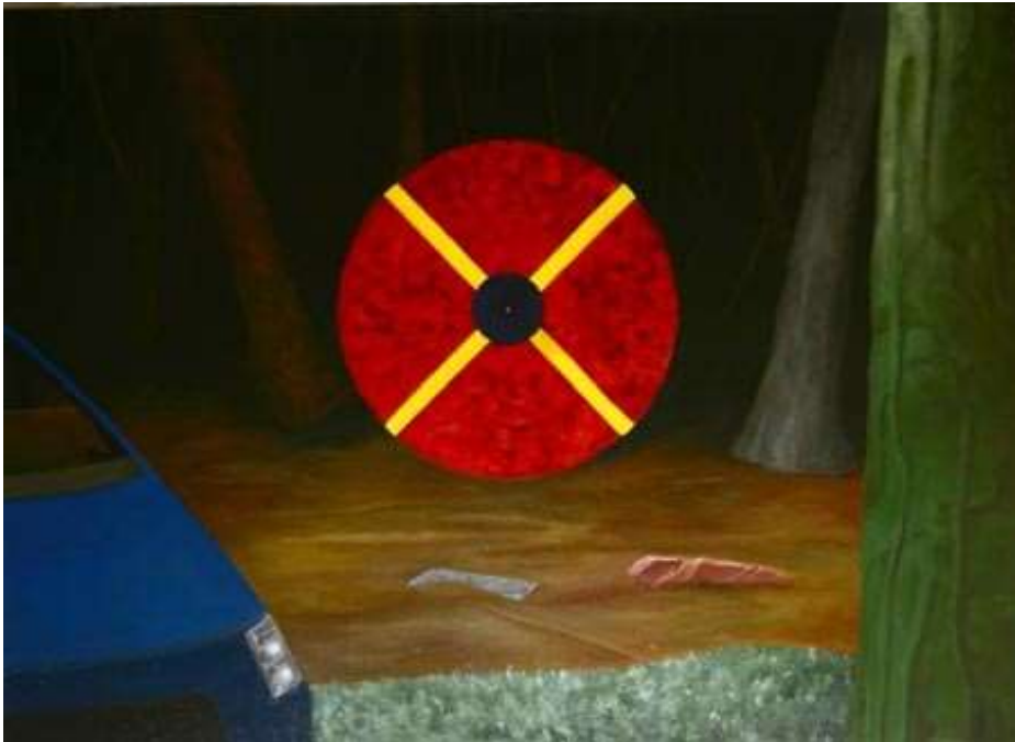
Time Gate, olie, 80 x 110 cm, 2023