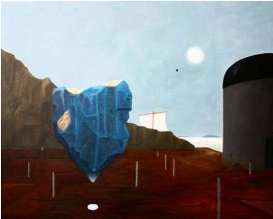
Enlightened Nature, (Hommage á Giorgio de Chirico), olie, 81 x 65 cm, 2021