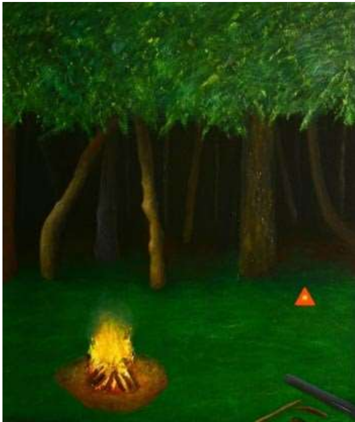
The Silent Glade, olie,70 x 60 cm, 2023