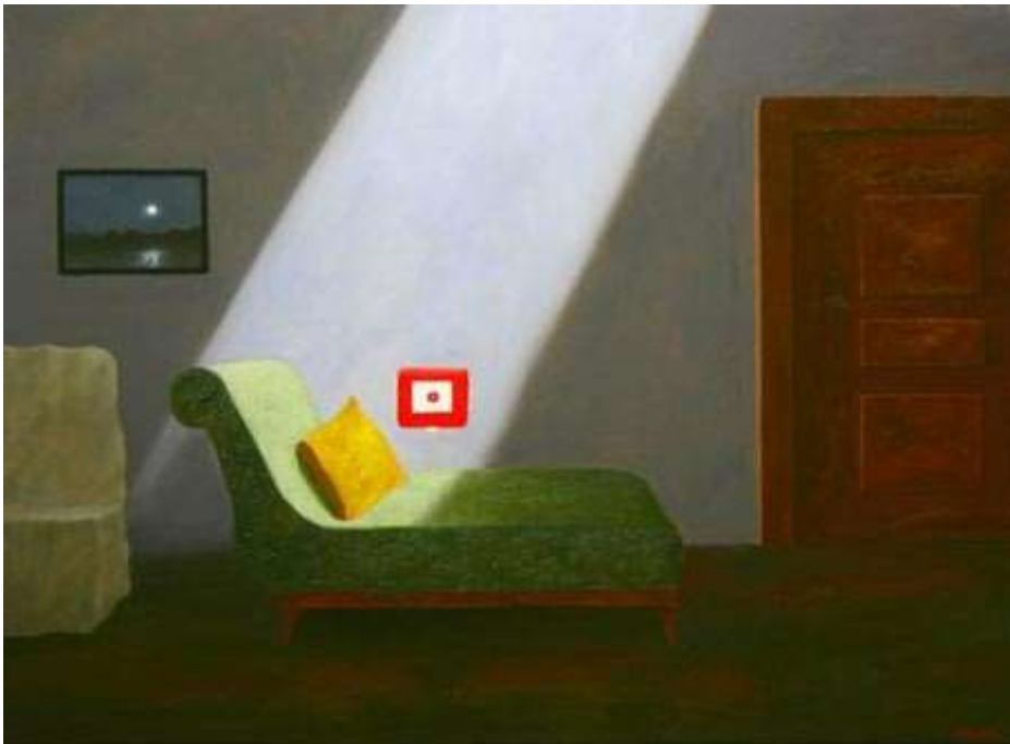
Fire Alarm, olie, 55 x 75 cm, 2023