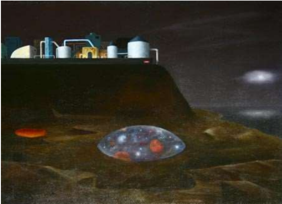
Memory of the Future, olie, 55 x 75 cm, 2021