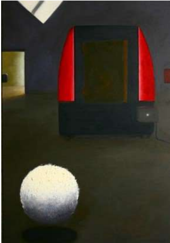
Experimental Station, olie, 85 x 60 cm, 2022