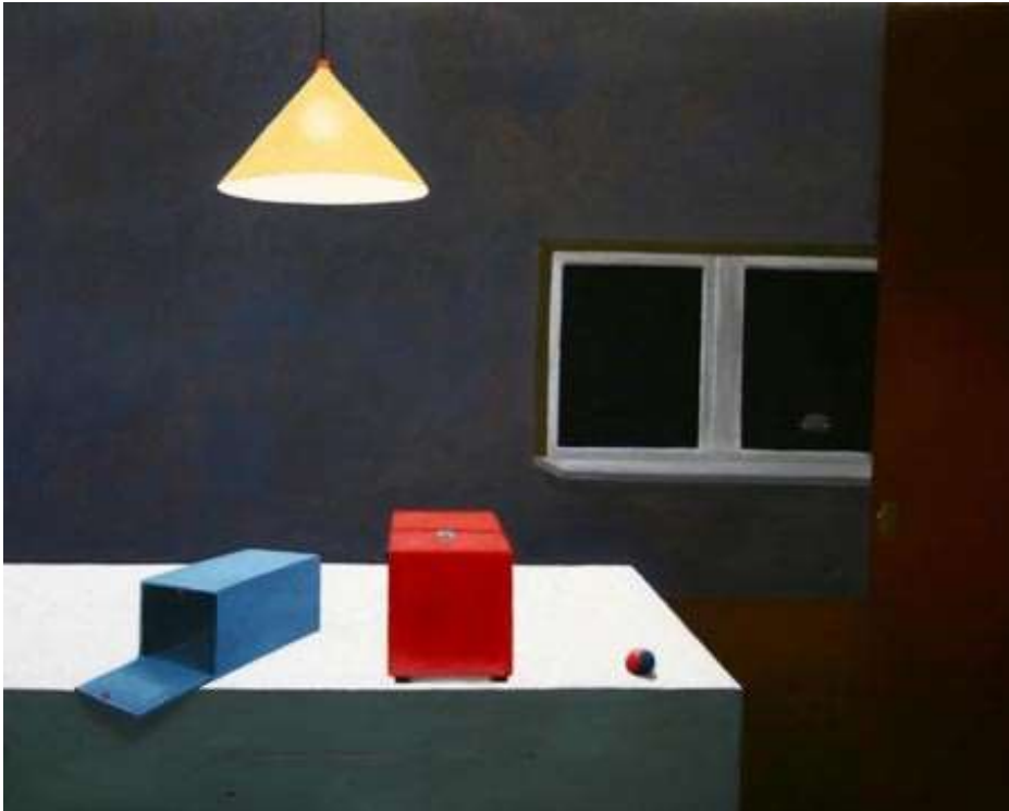
The Enigmatic Red Box, olie, 65 x 81 cm, 2023-24