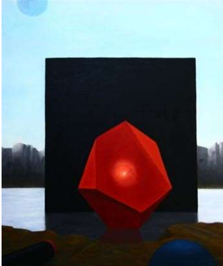
Inner Light, olie, 70 x 60 cm, 2022