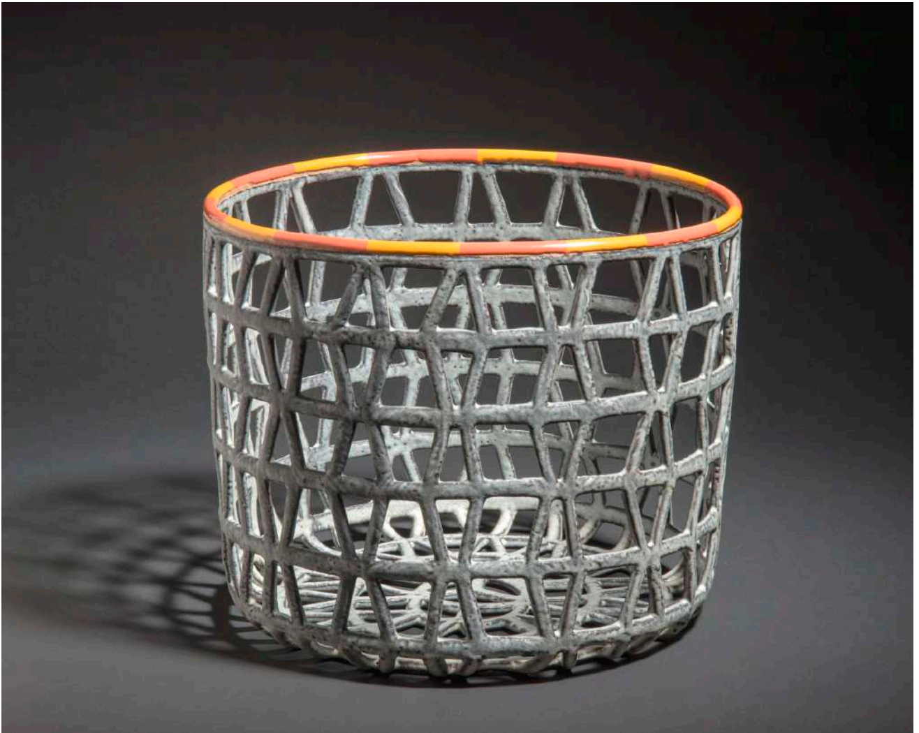
Malene Müllertz, "Net with orange border" 2008 Stoneware 22x28x26 cm