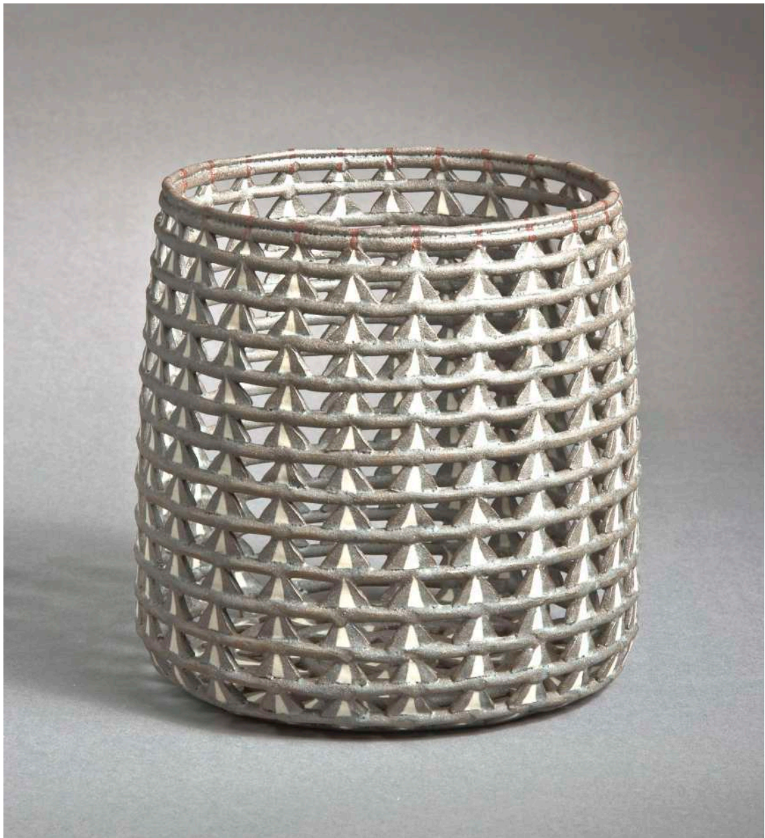
Malene Müllertz, "Intarsia Basket dark" 2010 Stoneware 21x21x21 cm