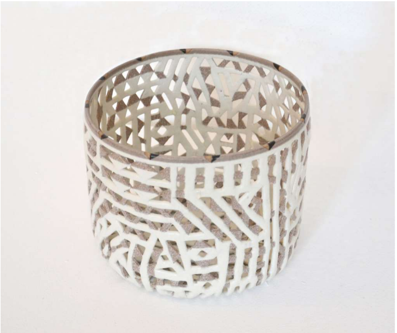
Malene Müllertz, "Andalusian lace net" 2011 Stoneware 18x22x22 cm