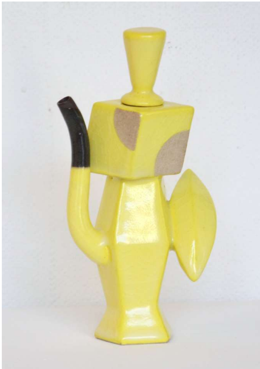
Malene Müllertz, "Yellow pitcher with tounure" 2021 Stoneware 22x10x6 cm