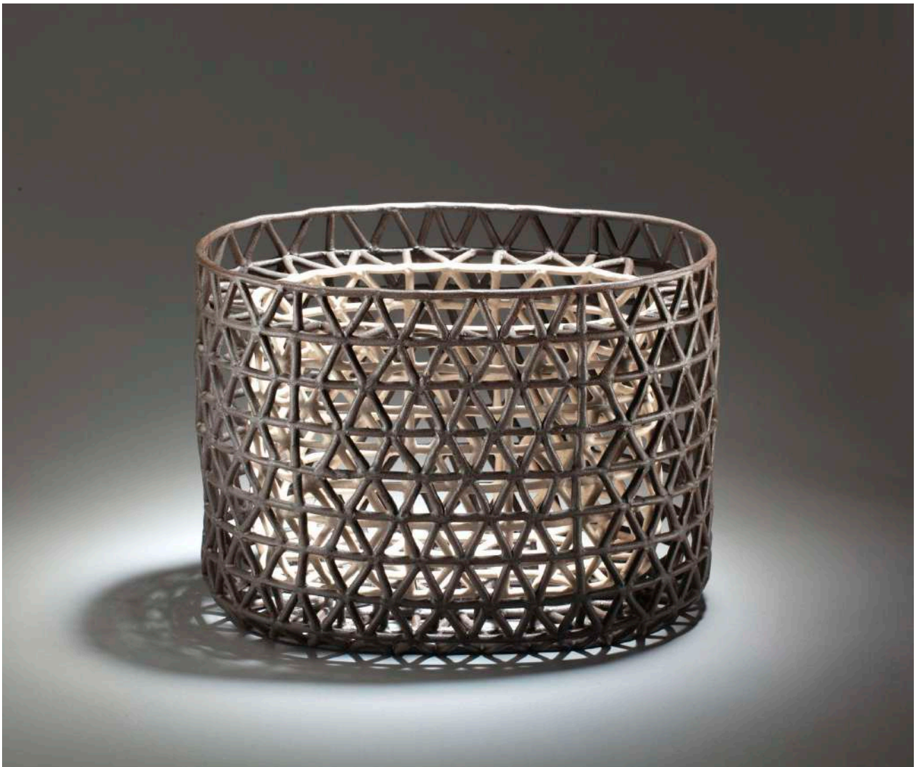
Malene Müllertz, "Zen, oval double basket" 2015 Stoneware 22x30x21 cm