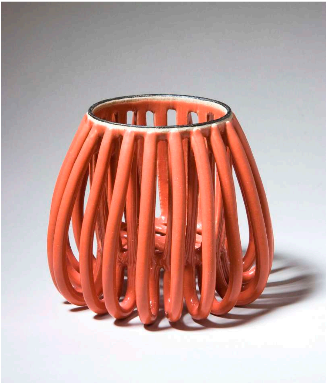
Malene Müllertz, "Root net small red" 2004 Stoneware 11x14x14 cm