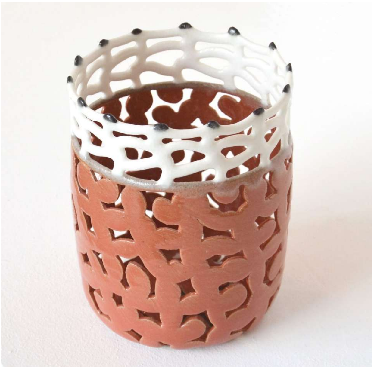
Malene Müllertz, "Small coral mesh" 2021 Stoneware, 18x14x14 cm