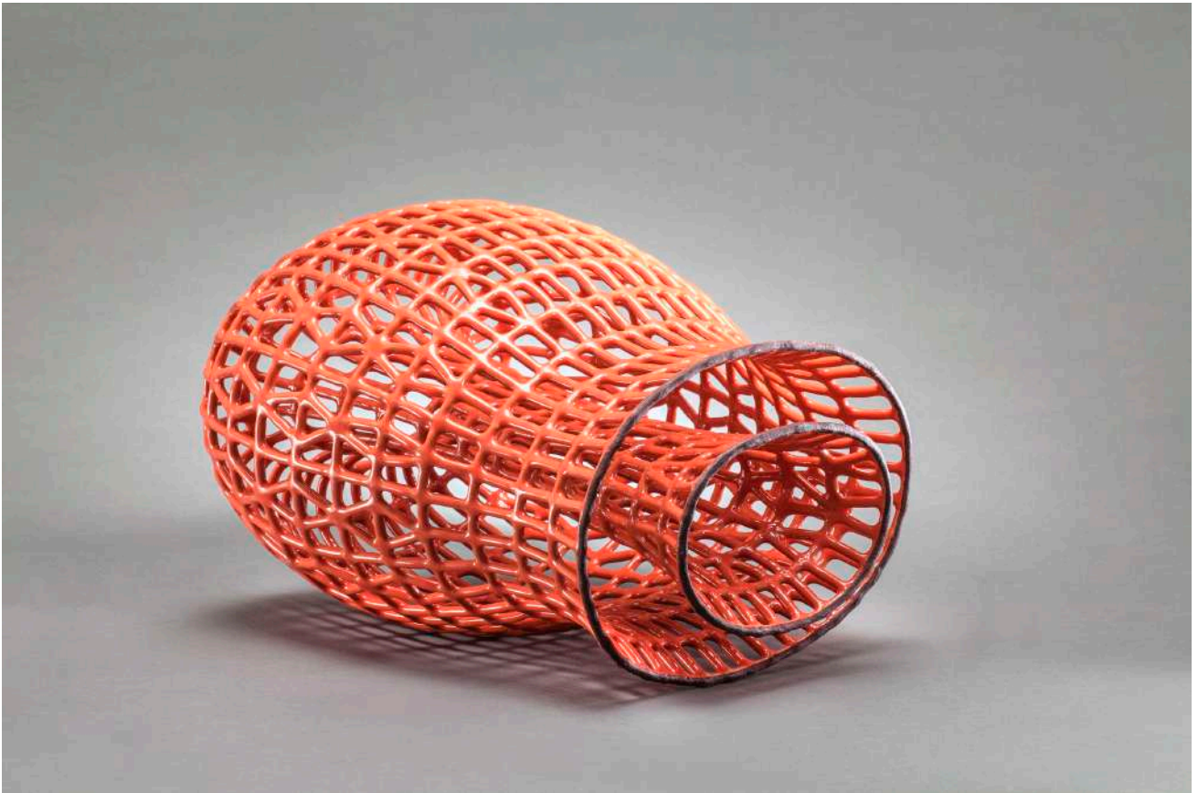
Malene Müllertz, "Red Ruse" 2023 Stoneware, 39x32x25 cm