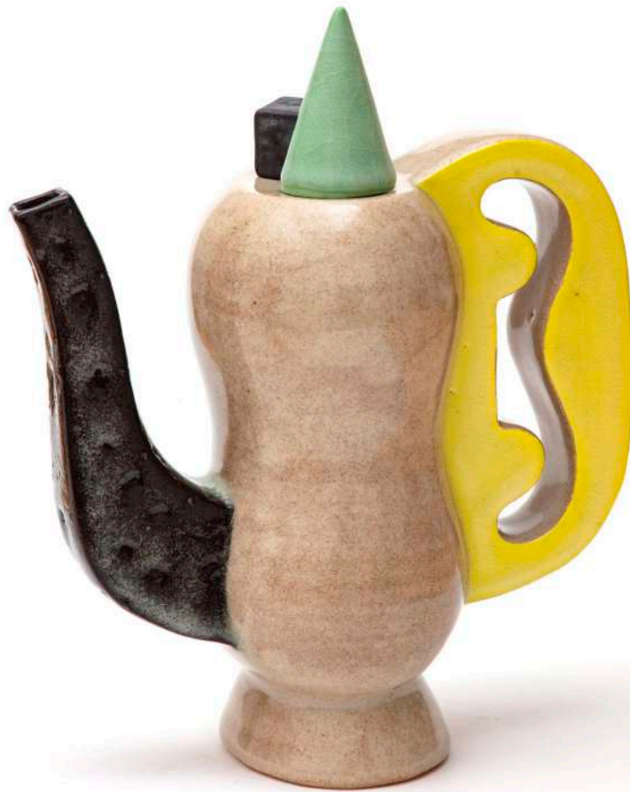
Malene Müllertz, "Pitcher with yellow ear" 2021 Stoneware 24x20x10 cm