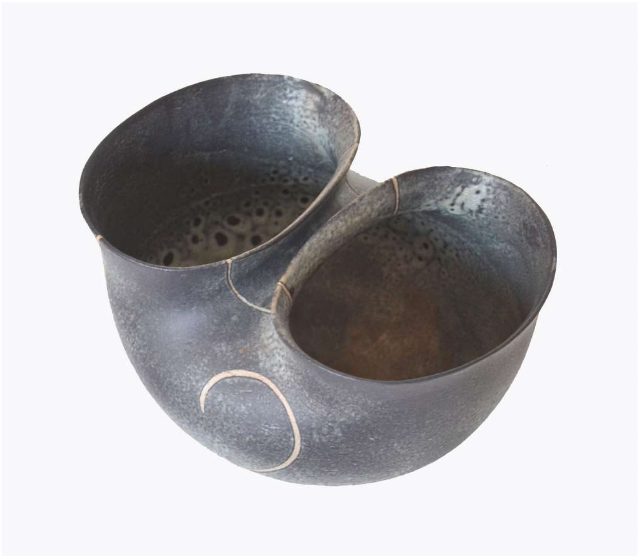
Malene Müllertz, "Double bowl with spiral" 2002 Stoneware 16x27x20 cm