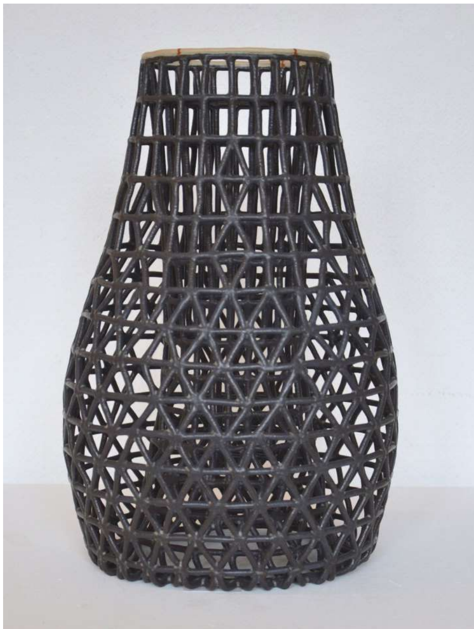
Malene Müllertz, "Black stitched ruse" Stonewarej 34x22x16 cm