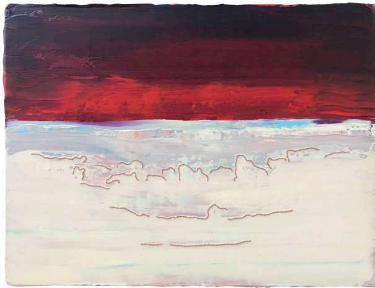
Bel & Vitor Azambuja, Hot Dreams 2023 Acrylic & yarn on canvas, 30x40 cm