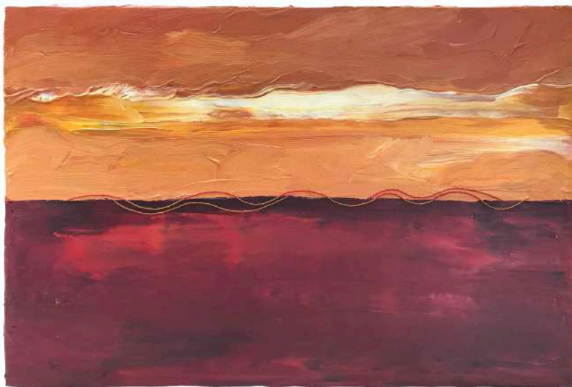
Bel & Vitor Azambuja, Carnival 2023 Acrylic & yarn on canvas, 40x60 cm