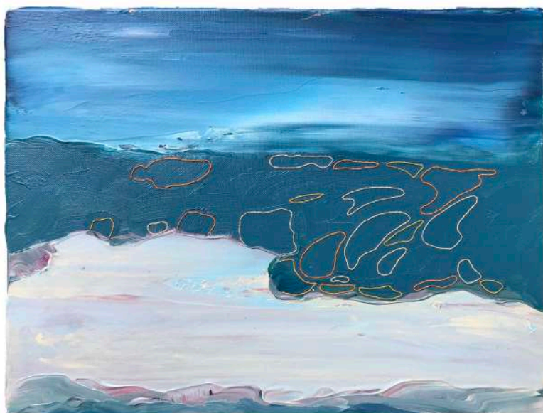
Bel & Vitor Azambuja, Sign of the Times 2023 Acrylic & yarn on canvas, 30x40 cm