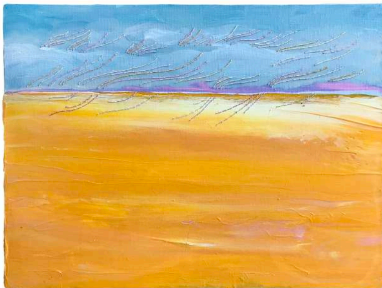
Bel & Vitor Azambuja, Breeze 2023 Acrylic & yarn on canvas, 30x40 cm