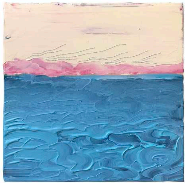
Bel & Vitor Azambuja , Strawberry Clouds 2023 Acrylic & yarn on canvas, 30x30 cm