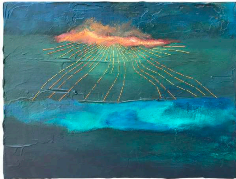
Bel & Vitor Azambuja, Lava 2023 Acrylic & yarn on canvas, 30x40 cm