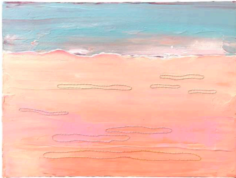
Bel & Vitor Azambuja, Peaches 2023 Acrylic & yarn on canvas, 30x40 cm