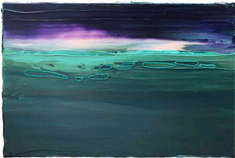
Bel & Vitor Azambuja, Northern Light 2023 Acrylic & yarn on canvas, 20x30 cm