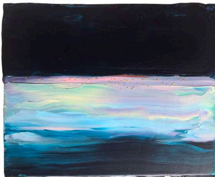
Bel & Vitor Azambuja, The Night of the Poets 2023 Acrylic & yarn on canvas, 22x27 cm