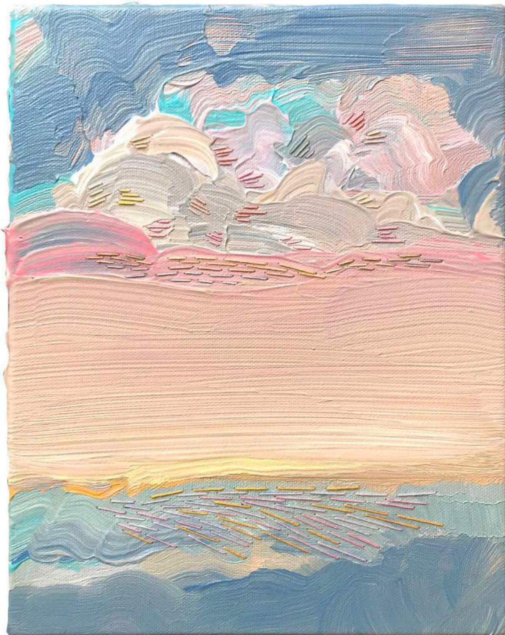
Bel & Vitor Azambuja, Ice Cream Soda 2023 Acrylic & yarn on canvas, 24x19 cm