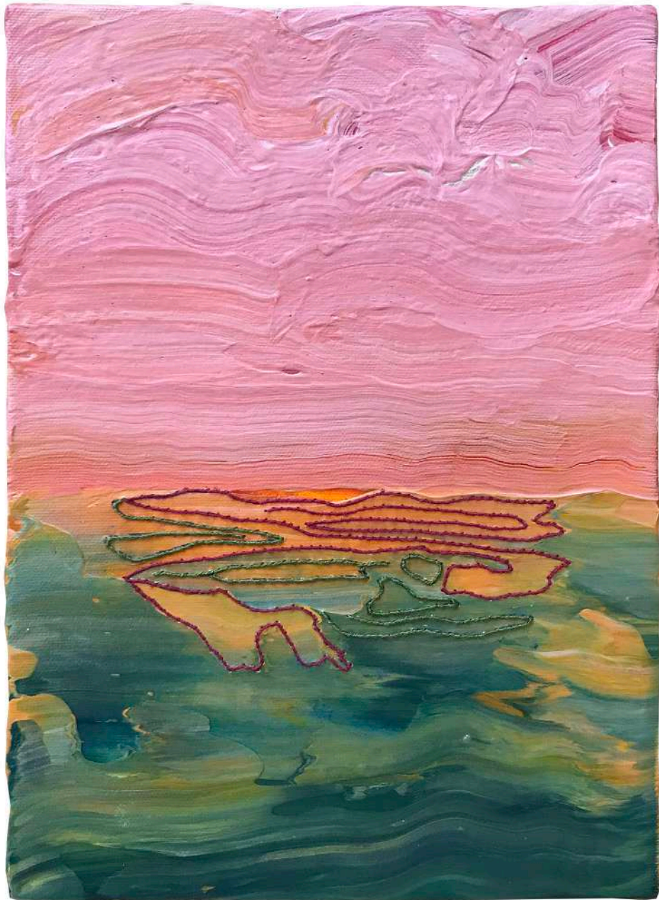
Bel & Vitor Azambuja, Rødgrød med Fløde 2023 Acrylic & yarn on canvas, 27x19 cm