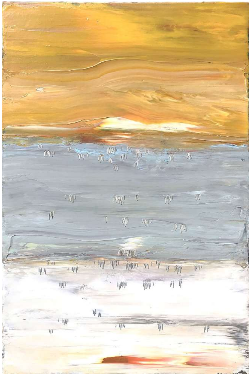
Bel & Vitor Azambuja , Honey 2023 Acrylic & yarn on canvas, 60x40 cm