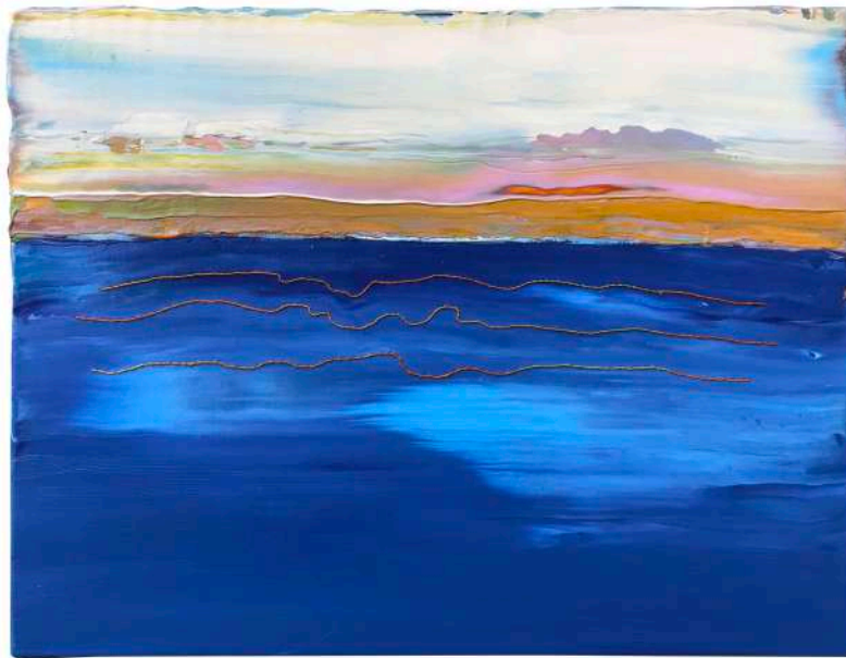
Bel & Vitor Azambuja, Sunset 2023 Acrylic & yarn on canvas, 30x40 cm