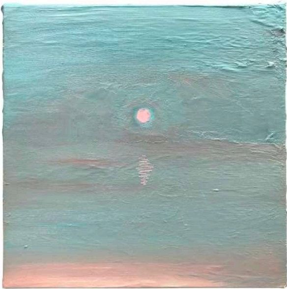
Bel & Vitor Azambuja , Monet 2023 Acrylic & yarn on canvas, 30x30 cm