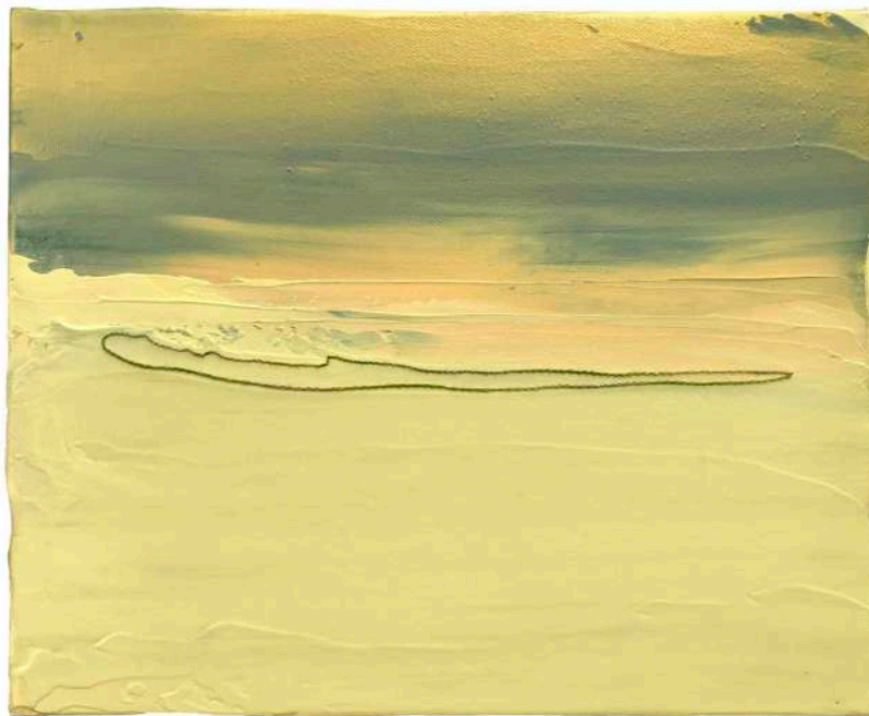
Bel & Vitor Azambuja, Golden Light 2023 Acrylic & yarn on canvas, 22x27 cm