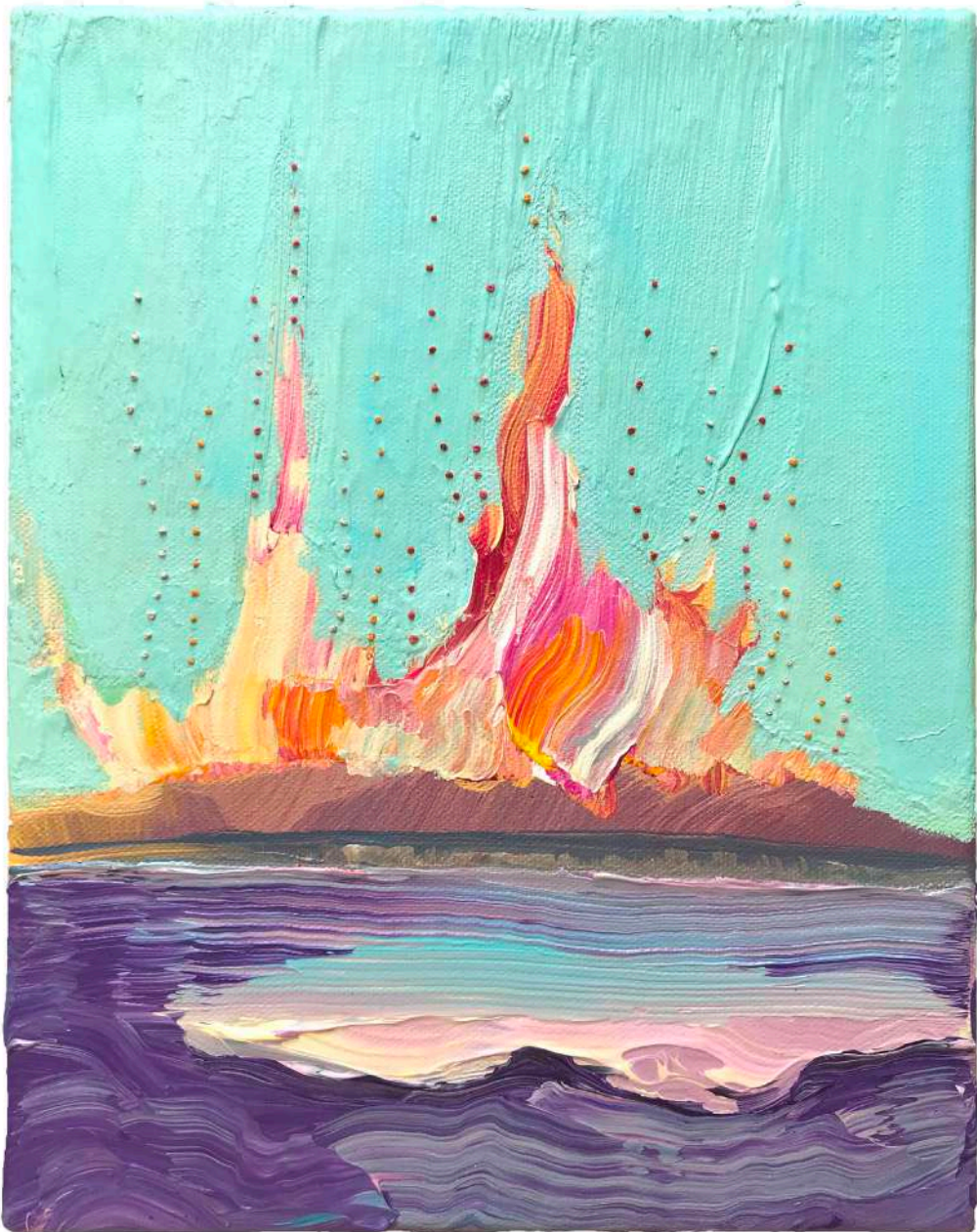
Bel & Vitor Azambuja, Burning Lake 2023 Acrylic & yarn on canvas, 27x19 cm