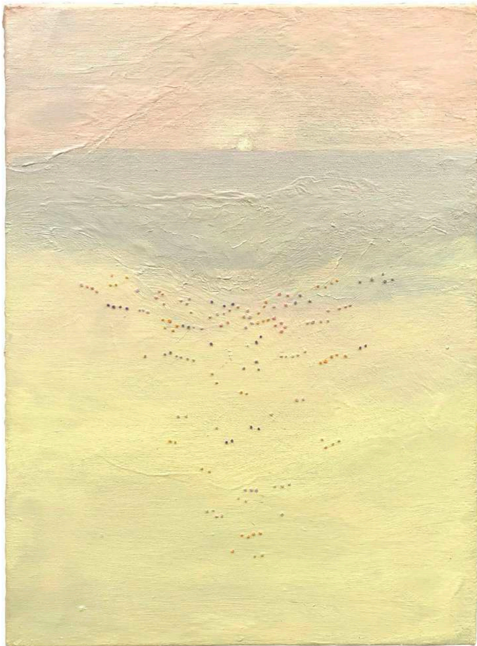
Bel & Vitor Azambuja, Vanilla Cake 2023 Acrylic & yarn on canvas, 30x22 cm