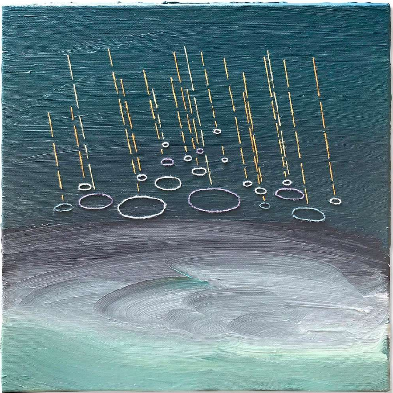
Bel & Vitor Azambuja , Colored Rain 2022 Acrylic & yarn on canvas, 30x30 cm