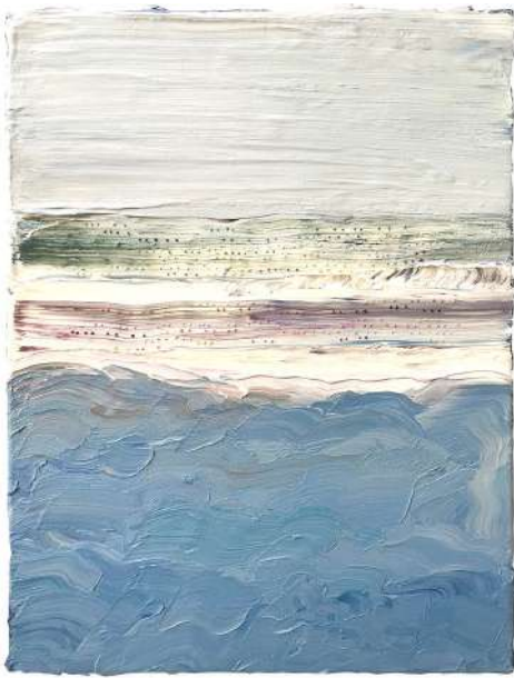
Bel & Vitor Azambuja, Hornbaek 2022 Acrylic & yarn on canvas, 40x30 cm