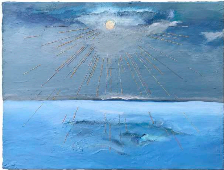
Bel & Vitor Azambuja, The Little Mermaid 2022 Acrylic & yarn on canvas, 30x40 cm