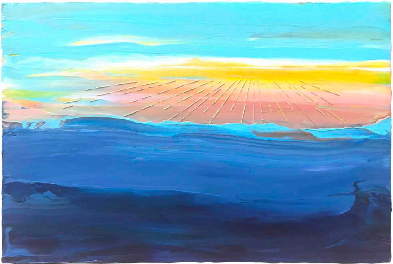
Bel & Vitor Azambuja, Enjoy the Moment 2023