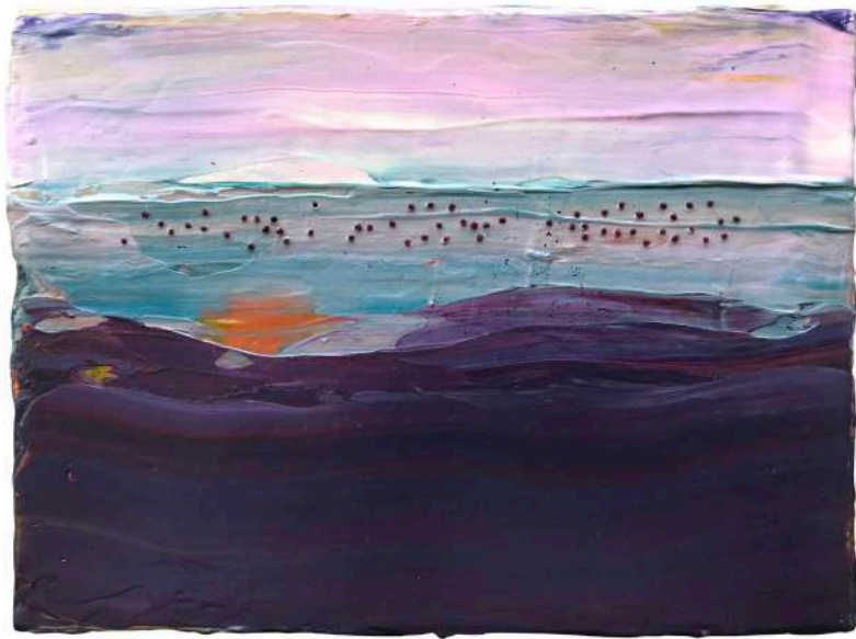
Bel & Vitor Azambuja, Blue Berries 2023 Acrylic & yarn on canvas, 16x22 cm