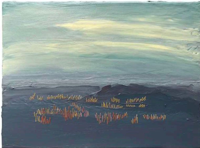
Bel & Vitor Azambuja, Mint 2022 Acrylic & yarn on canvas, 22x30 cm